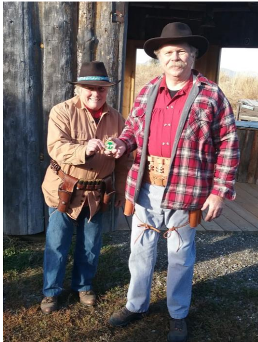
Sheriff Granny Gunsmoke presents badge to Yetti Longbarrel