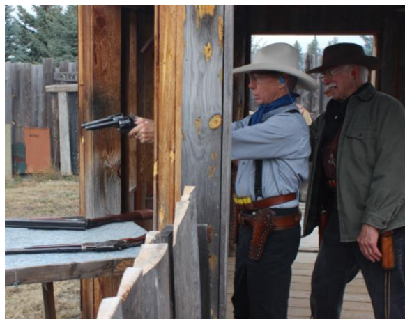
Rooster Dogburn putting lead downrange