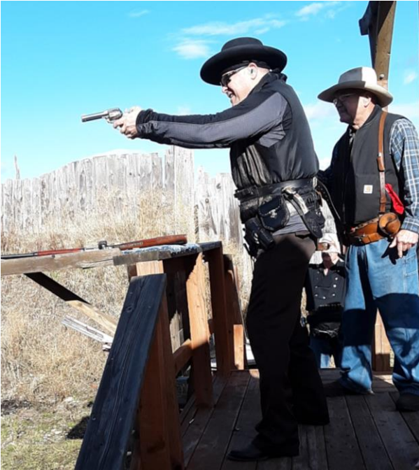
Covada RO's Copenhagen Kid from the gallows