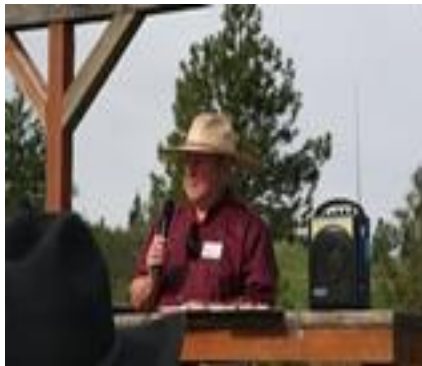
Ranger Six Welcomes All