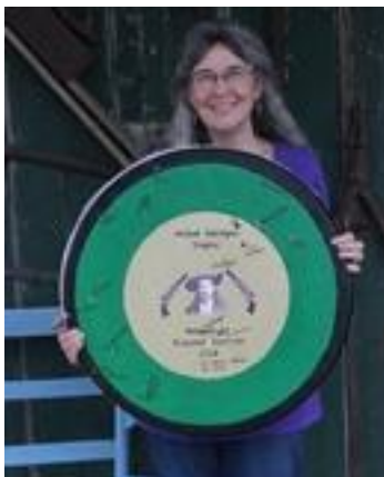
Fire Opal Winner of the Hickok Trophy