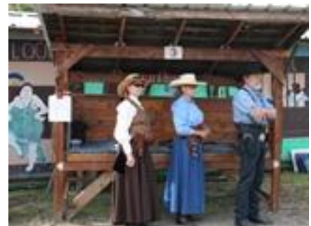
Loaded Up & Ready to Go